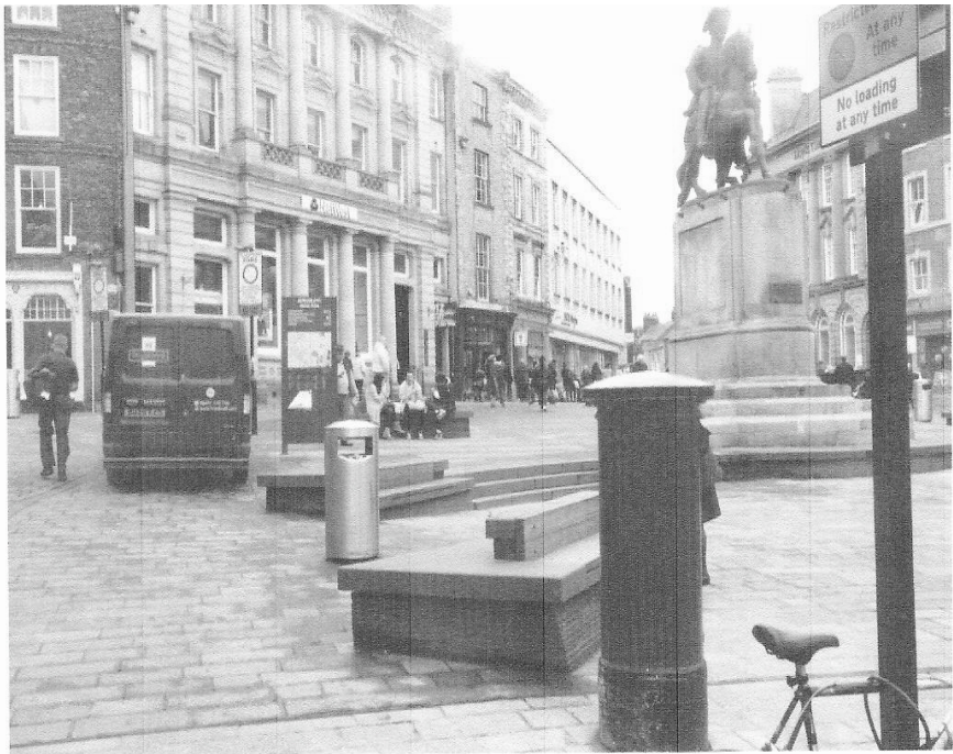
Postman leaving van to deliver mail in Saddler Street

processed, since the County Council was both promoter of the scheme and the planning authority responsible for considering it. Although the listed building elements of the planning proposals were statutorily referred to the Secretary of State for ultimate determination, paradoxically this referral diminished public accountability by taking the decision-making on the listed building applications outside the jurisdiction of the Local Government Ombudsman - and also beyond the likely scope of a successful application for Judicial Review. The QC's advice which the Trust received was that,