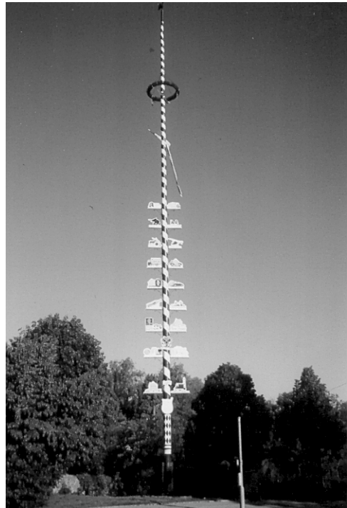
Maypole in Munich